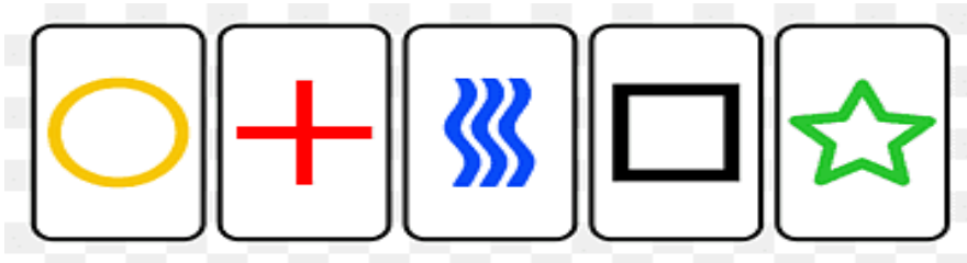
(Figure 4: Deck of 25 cards had 5 cards of each of above shapes)

In his experiments, Rhine would hold up the card with the back side forward and ask the subject to tell him which design was on the front of the card to test Telepathy. The card seen by Rhine could be read by the subject by reading his mind.