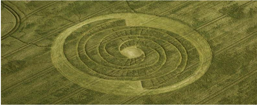
Figure 6– A crop circle in a wheat field in England

Formations are usually created overnight, although some are reported to have appeared during the day. The number of reports of crop circles has substantially increased since the 1970s. There has been a scant scientific study of them. Circles in the United Kingdom are not distributed randomly across the landscape but appear near roads, areas of medium to dense population and cultural heritage monuments. Nearly half of all crop circles found in the UK in 2003 were located within a 15-kilometre radius of the Avebury stone circles.