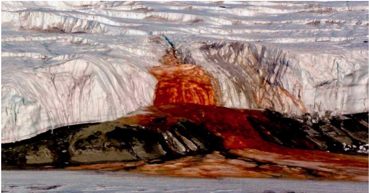
Figure 2: (The falls with red water is seen at Eastern part of Antarctica – in the McMurdo Dry Valley https://www.forbes.com/sites/trevornace/2017/04/28/mystery-of-antarcticas-blood-falls-is-finally-solved/ .)

This creepy yet fascinating phenomenon can be seen from a helicopter or cruise ship in the Ross Sea.