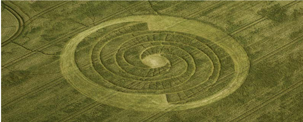
Figure 6— A crop circle in a wheat field in England

Formations are usually created overnight, although some are reported to have appeared during the day. The number of reports of crop circles has substantially increased since the 1970s. There has been a scant scientific study of them. Circles in the United Kingdom are not distributed randomly across the landscape but appear near roads, areas of medium to dense population and cultural heritage monuments. Nearly half of all crop circles found in the UK in 2003 were located within a 15-kilometre radius of the Avebury stone circles.