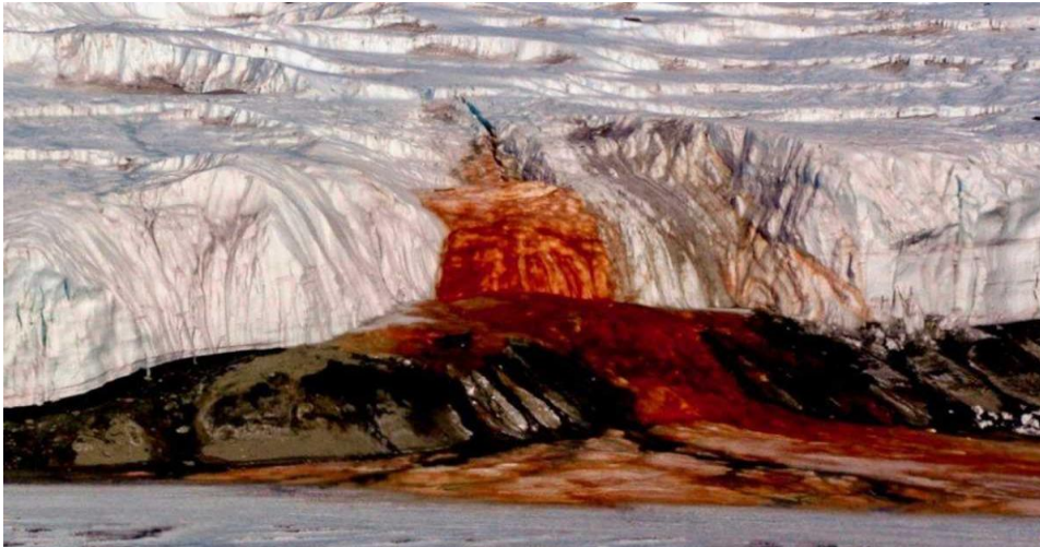
Figure 2: (The falls with red water is seen at Eastern part of Antarctica – in the McMurdo Dry Valley https://www.forbes.com/sites/trevornace/2017/04/28/mystery-of-antarcticas-blood-falls-is-finally-solved/ .)

This creepy yet fascinating phenomenon can be seen from a helicopter or cruise ship in the Ross Sea.