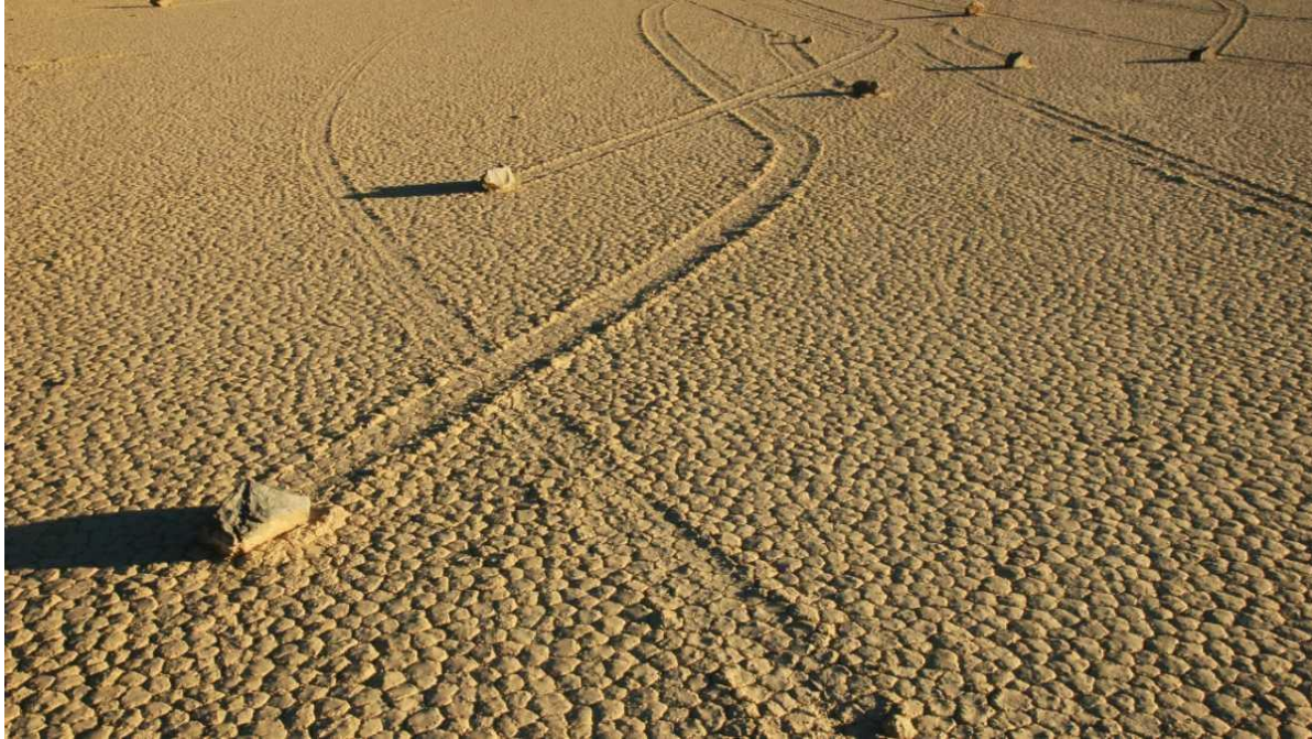
(Figure 1--- Trails of Rolling Stones found at Death Valley National Park (California), and at Little Bonnie Claire Playa (Nevada). http://blog.universalyarn.com/2018/01/26/free-pattern-friday-sailing-stone-shawl/ .)

Who knew there was another meaning to the world rolling stones, and that too a literal one? Rolling stones or sailing stones or moving stones is a geological phenomenon where rocks move along a smooth valley without any animal or human force. They also leave long trails as they move.