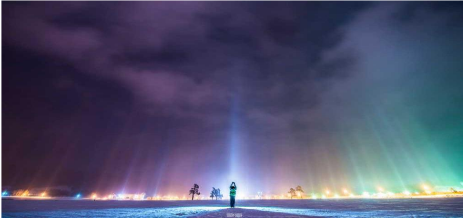
( Figure 3: Light pillars seen in US and Canada

https://www.forbes.com/sites/trevornace/2017/04/28/mystery-of-antarcticas-blood-falls-is-finally-solved/ .)