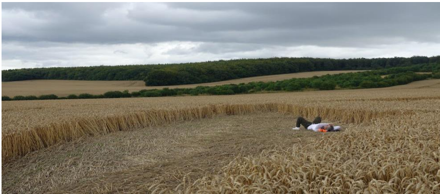
Figure 7: crop circle enthusiast from Dublin lies on the ground to connect with what he believes are sacred energies in a crop circle in Wiltshire, England, in July. (Paul Kingsbury)

Unlike UFOs, crop circles are tangible — people can touch and walk into them.