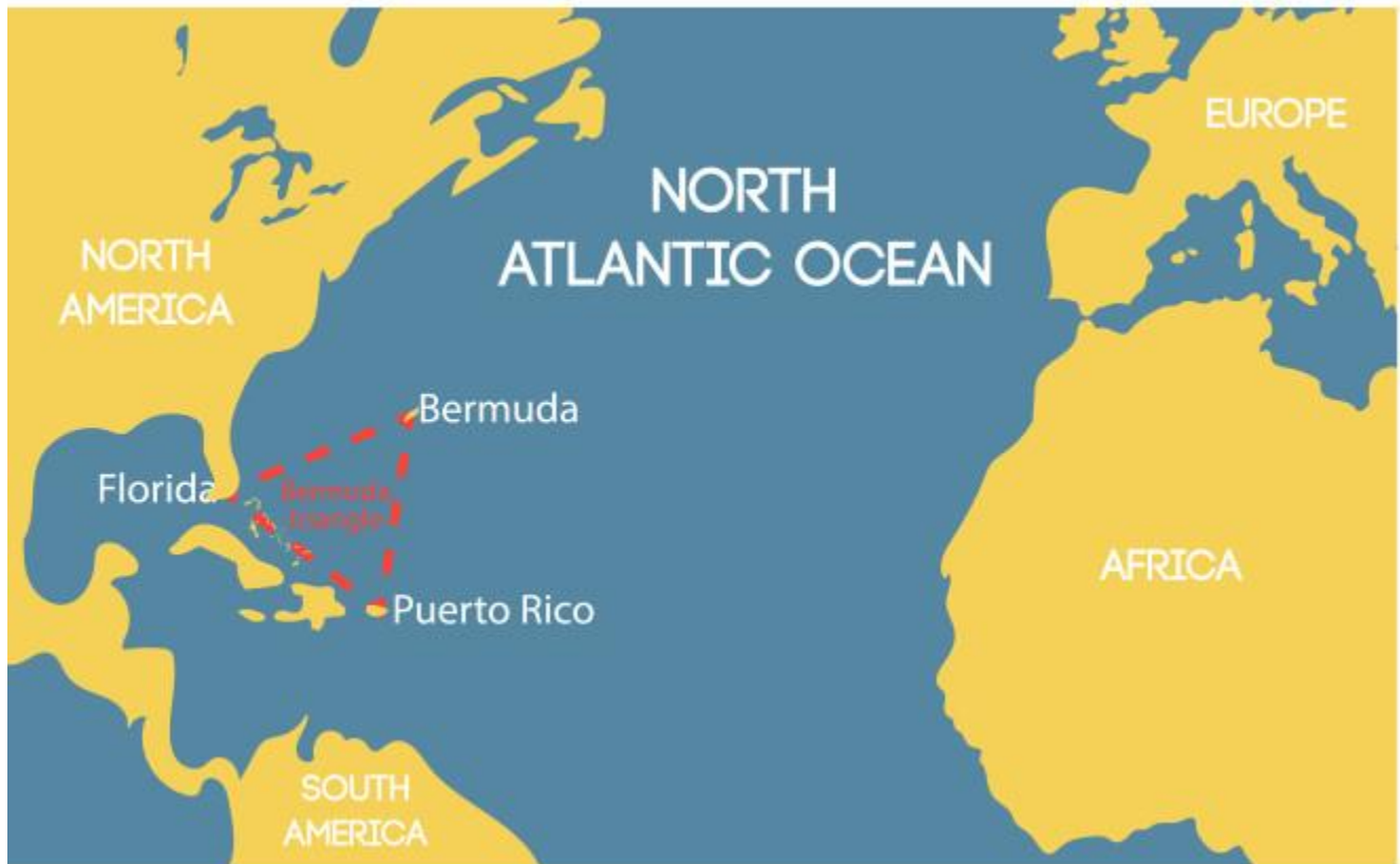
Figure 5: A map showing the approximate area of the Bermuda Triangle in the Atlantic Ocean.

The Bermuda Triangle, also known as the Devil's Triangle, is an area of the Atlantic Ocean covering an imaginary boundary between Florida, Puerto Rico and Bermuda that is best known for its stories of ships and aeroplanes that seemed to have disappeared without a trace. The phenomenon is termed paranormal as the cause of disasters is unknown and the wreckage is seldom found.