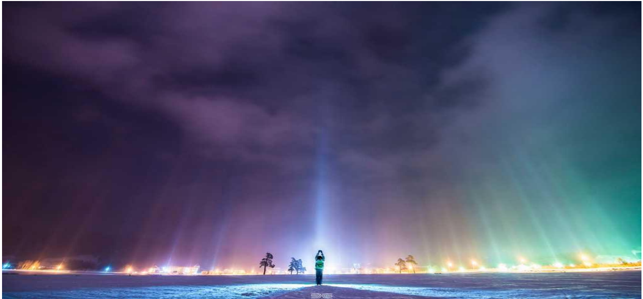
( Figure 3: Light pillars seen in US and Canada

https://www.forbes.com/sites/trevornace/2017/04/28/mystery-of-antarcticas-blood-falls-is-finally-solved/ .)