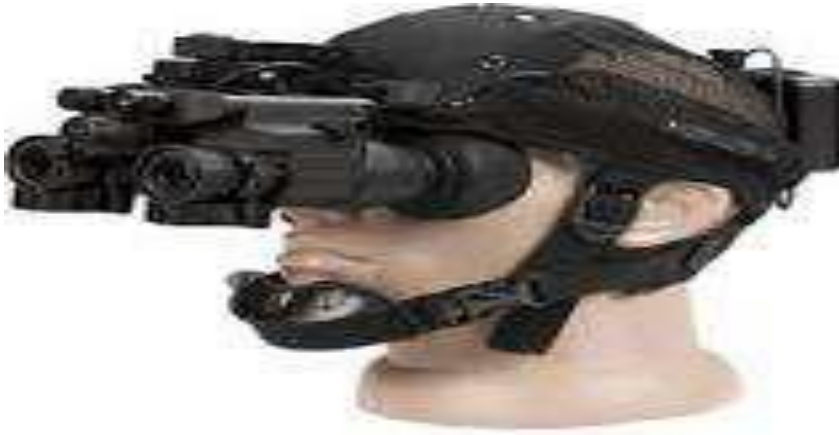
Picture showing Night Vision Goggle

We end this section related to terms associated with paranormal ghost hunting with Digital Ghost Hunting Thermometers.