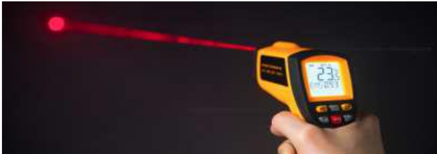
The picture shows IR digital Thermometers used by Paranormal Investigators

Digital Ghost Hunting Thermometers help aspiring ghost hunters detect "cold spots," which are often attributed to areas of paranormal activity.