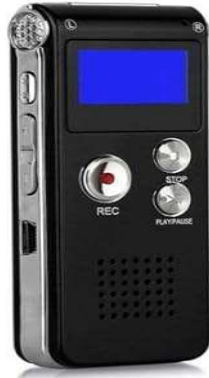
Picture showing EVP recorder used in Paranormal Investigation

Another aspect of the foundation on which paranormal investigation rests --that ghosts have capability of producing voices, footsteps and noises which are not audible to human ears but can be picked up by sensitive EVPs.