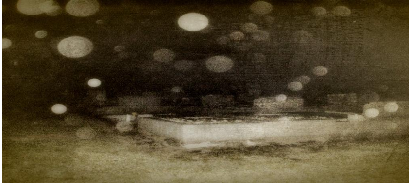
Picture of Orbs