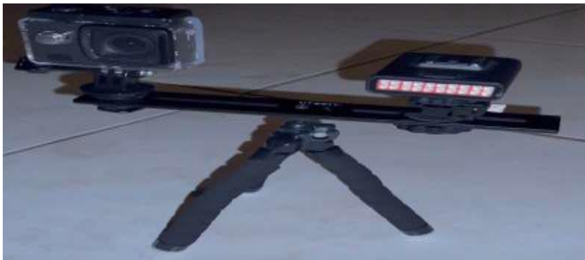
Picture of night vision camera

Ghost lights and Orbs ghost lights —These are lights (or fires) that appear in the atmosphere without an obvious cause. According to legend, some lights are wandering spirits of the dead. These lights are not captured on ordinary cameras but can be captured by Night vision cameras. Night vision cameras are used on the assumption that the movement of ghosts which is not visible in ordinary light could be visible to night vision cameras.