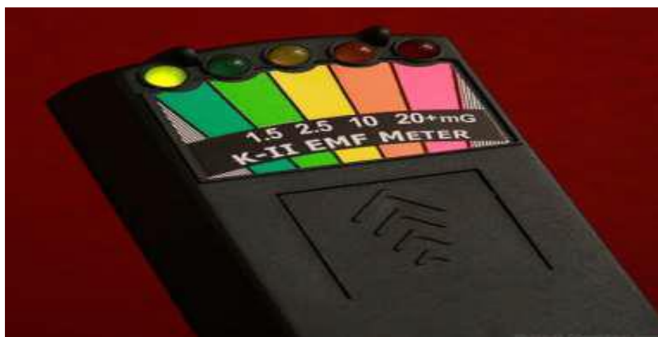
Picture showing K2/EMF meter

The K-II EMF Meter helps measure these fields to identify appliances that produce high-level emissions, allowing users to make informed decisions about limiting exposure. EMF fluctuations have also been associated with locations where unexplained phenomena have been reported, including alleged hauntings.