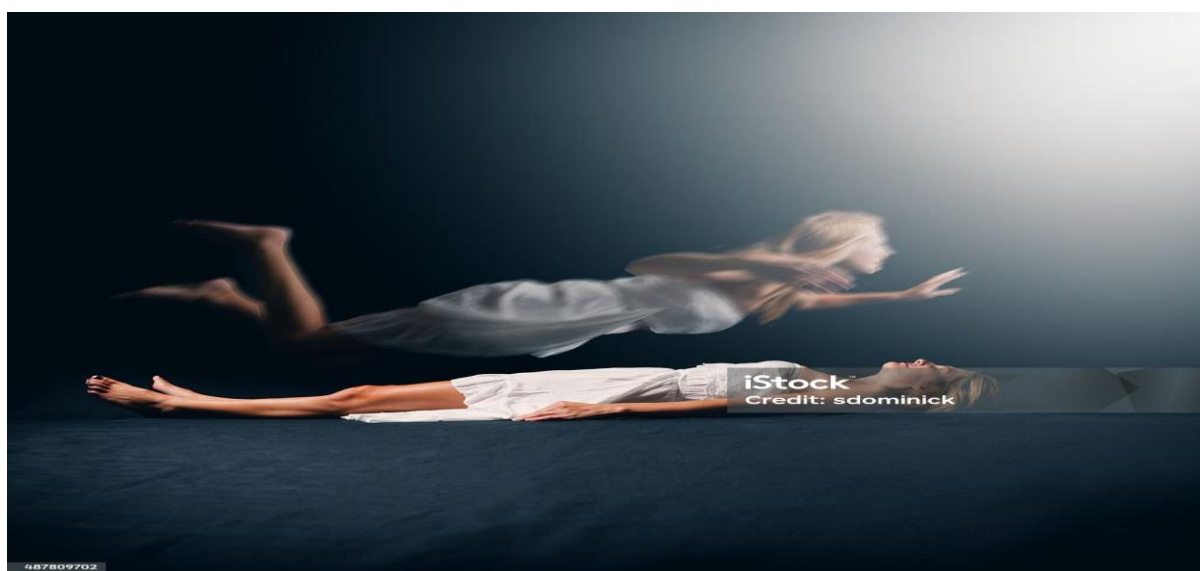
Figure: NDE depicting that consciousness can exist outside the physical body

Near-Death Experiences (NDEs) and Out of Body Experiences (OBEs) (where the experiencers are able to perceive the physical world including their own body, from outside the body) provide strong support to the view that perceptual awareness is possible without the physical body and hence consciousness may live on without a physical body.